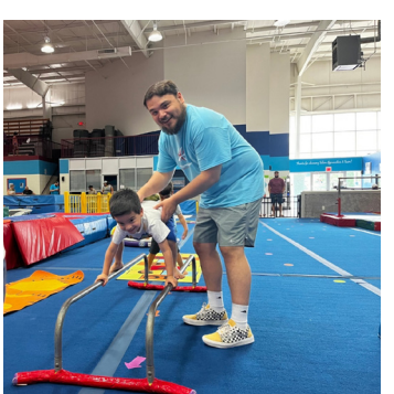
Kid's Morning Out