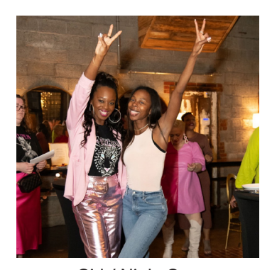
Girls' Night Out

Email advertising@forsythmags.com to learn more about any of the following events: